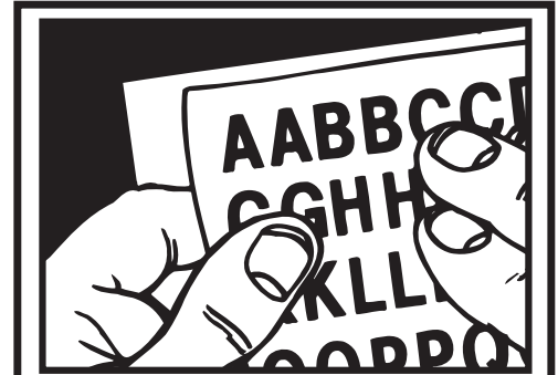
Fig. 1 Position decal.

Store in a clean, dry place, in a resealable plastic bag.