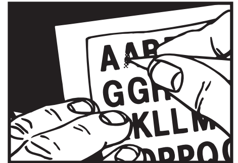
Fig. 2 Rub over decal.